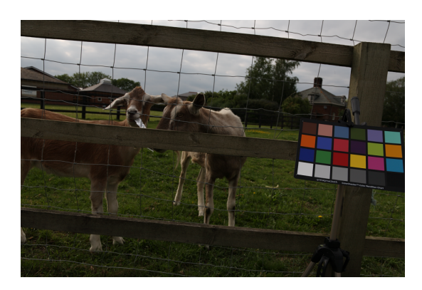
Fig. 1: An image from the Macbeth ColorChecker dataset.

Manuscript received October 27, 2018; revised October 27, 2018.